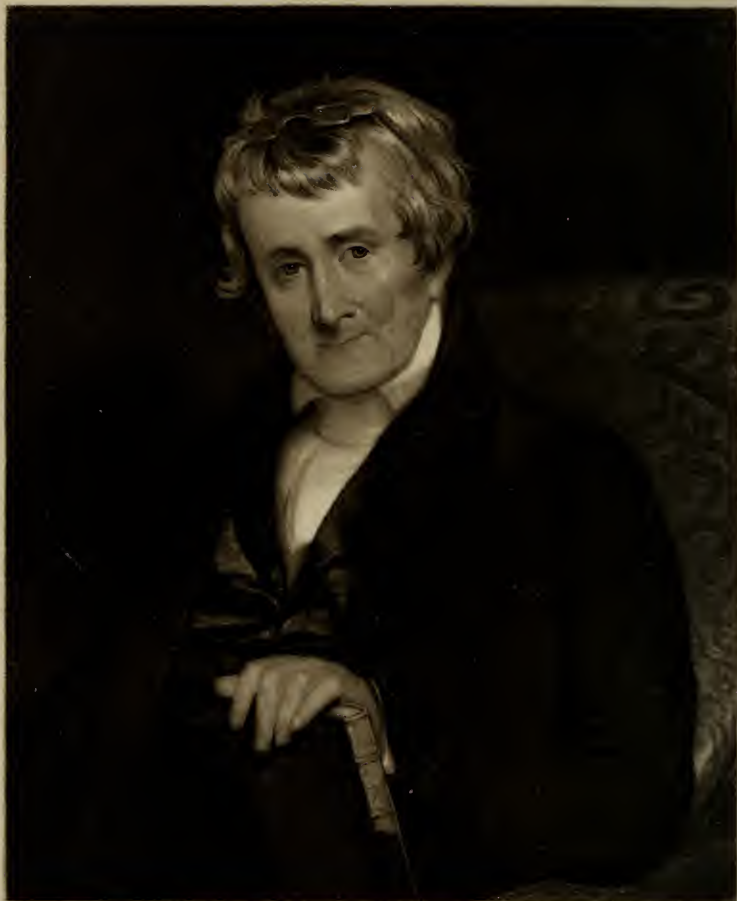
ALLEXANDER — THE GREAT